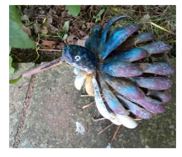
Kiwi for New Zealand