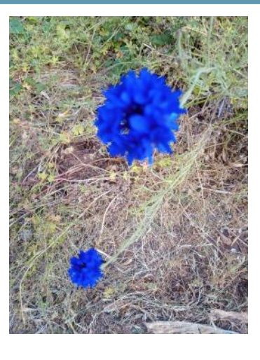
Cornflower for France