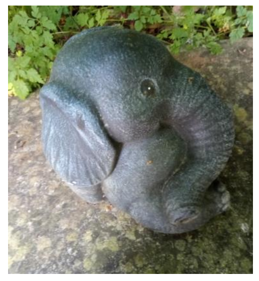
Elephant for India