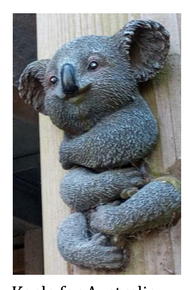
Koala for Australia