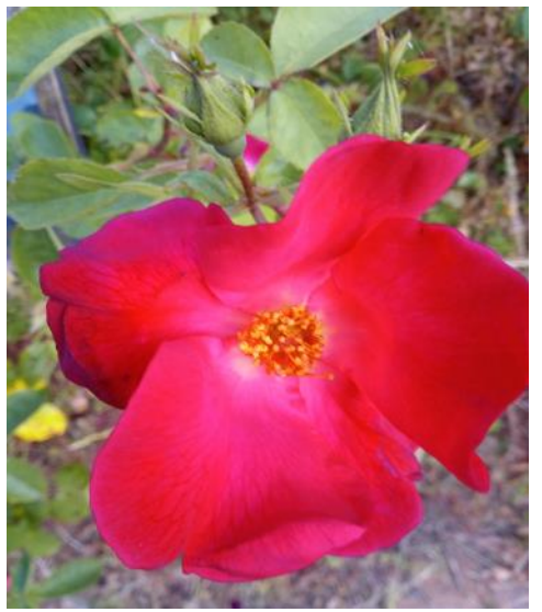
Talbot House Rose