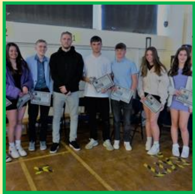
All Young Ambassador nominated