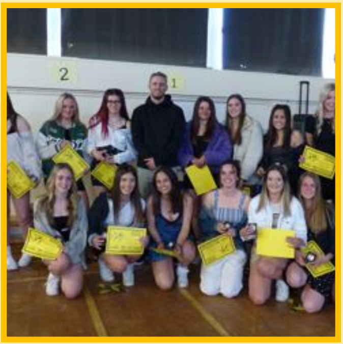
Full Colours Girls