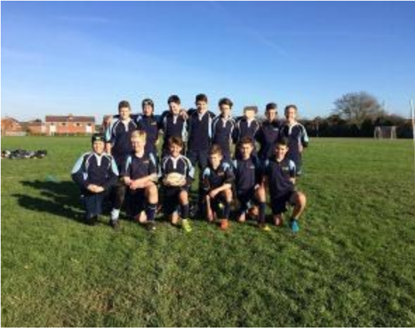
The Year 8 Rugby squad at the recent East Devon Emerging Schools Festival