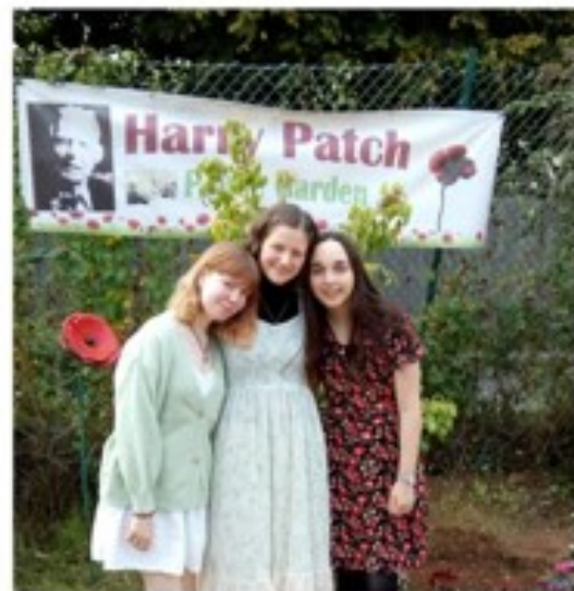
Two Clyst Vale students and their German exchange friend in front of the Harry Patch Garden

Perhaps next time you walk past the Harry Patch Garden, take a moment to pause and think of all those who were impacted, and show respect.