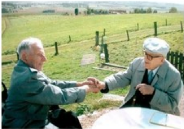
Harry Patch shaking the hand of a German War veteran, both aged over 105 years old.

Most of you have likely seen and walked past the Harry Patch Garden everyday without quite understanding the meaning of it.