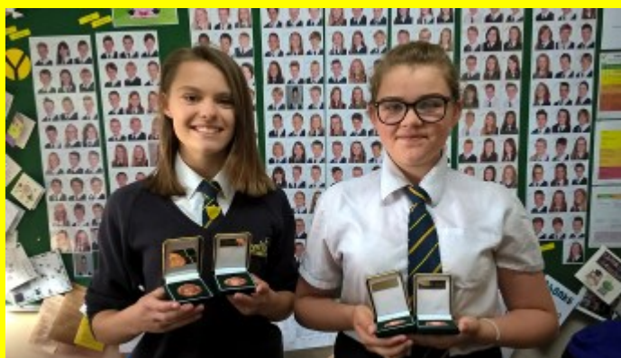
Yellow School Athletes