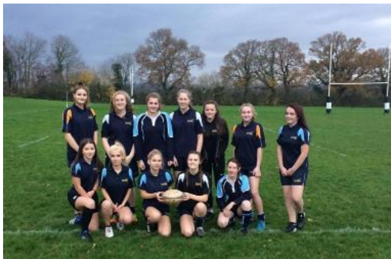
The U16 Girls Rugby Squad at Uffculme School for their recent fixture

The U16 girls put in an outstanding display of attitude and determination against Uffculme School on Wednesday. Despite losing by a try to nil, the girls' tackling and handling were nothing short of superb, in fading light and greasy conditions.